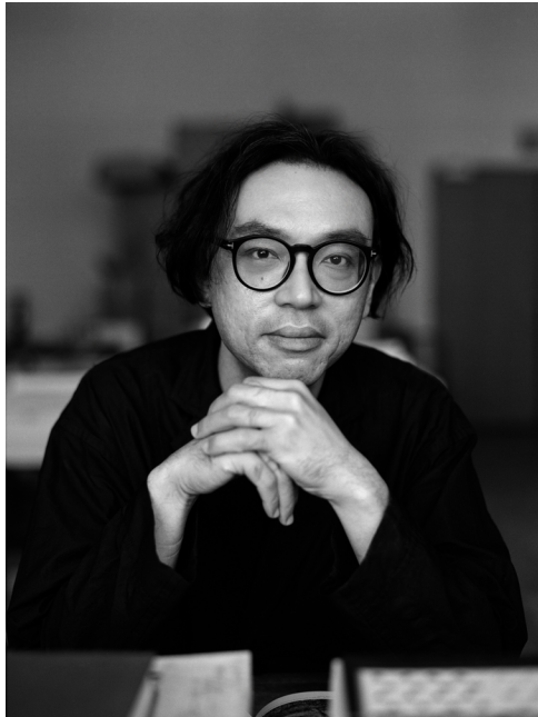
Singaporean artist Ho Tzu Nyen

Co-commissioned by Art Basel and M+ and presented by UBS, Night Charades by Singaporean artist Ho Tzu Nyen will illuminate the M+ Facade with a tribute to Hong Kong's vibrant film culture. Recomposed by AI and constantly re-edited by an algorithm, the work offers a dynamic re-interpretation of history. It evokes the collective memory of this singular cinematic legacy while generating a new, futuristic vision from it.