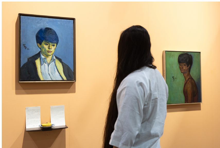
PPT Space (Taipei) at Art Basel Hong Kong 2024.

Several galleries are returning to the sector after a hiatus. They include: