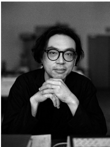
Singaporean artist Ho Tzu Nyen